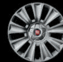
16" Steel Wheels (on SW body and HB 1.6 Multijet 130hp)