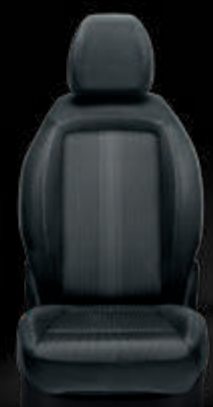
Fabric Skyline Black/Grey with double stitching