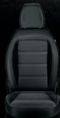
Fabric with Black riprese inserts and double stitching