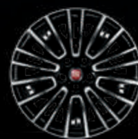
16" Styled Wheels