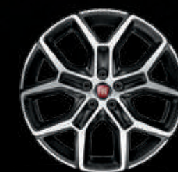
17" Alloy Wheels Matte Black Diamond Cut