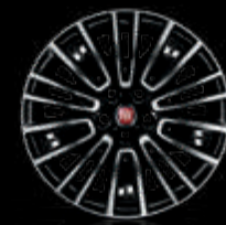
16" Styled Wheels