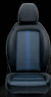
Fabric Skyline Black/Blue with double stitching