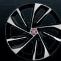
18" Alloy Wheels Diamond Cut