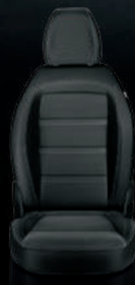
Fabric with Black ribose inserts and double stitching