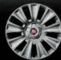
16" Steel Wheels