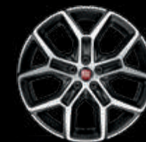
17" Alloy Wheels Matte Black Diamond Cut