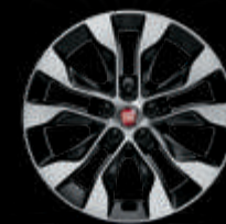
16" Alloy Wheels Diamond