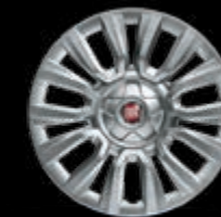
15" Steel Wheels