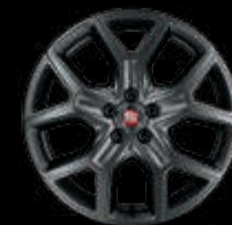
17" Alloy Wheels Matte Grey