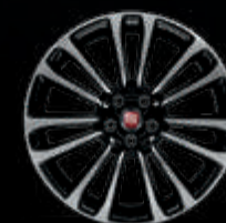
17" Alloy Wheels Diamond