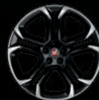
18" Alloy Wheels Bicolor Sport