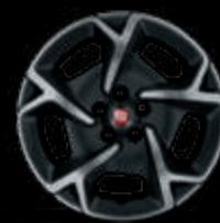
16" Styled Wheels Matte Black