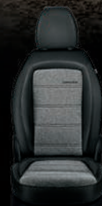
Melange Fabric with vinyl inserts and double stitching