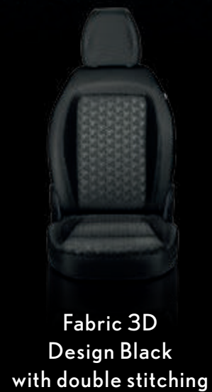
Fabric 3D Design Black with double stitching