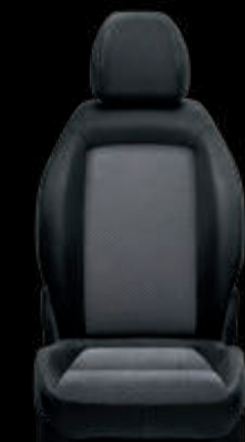
Fabric Trekking Black/Grey