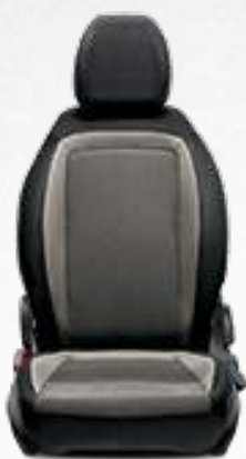
POP / EASY GREY