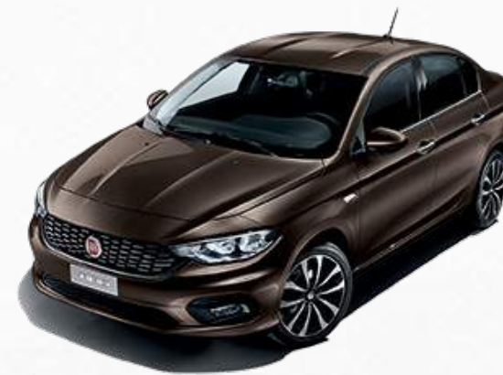
444 MAGNETIC BRONZE METALLIC