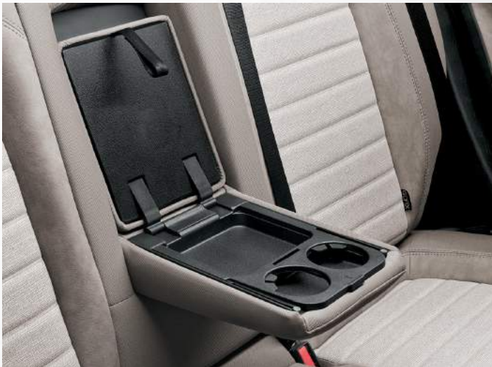
Central rear armrest with storage compartment and cup-holders.

All the comfort you need in just 4.54 metres of length. The new Tipo brings you class-leading habitability, with five comfortable, supportive seats, five upholstery options to choose from, and a wealth of storage