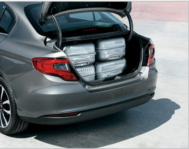
The wide-aperture boot gives you easy access when you're loading and unloading.

The new Tipo also brings you an extremely generous 520 litres of boot space, shaped to accommodate even the bulkiest loads.