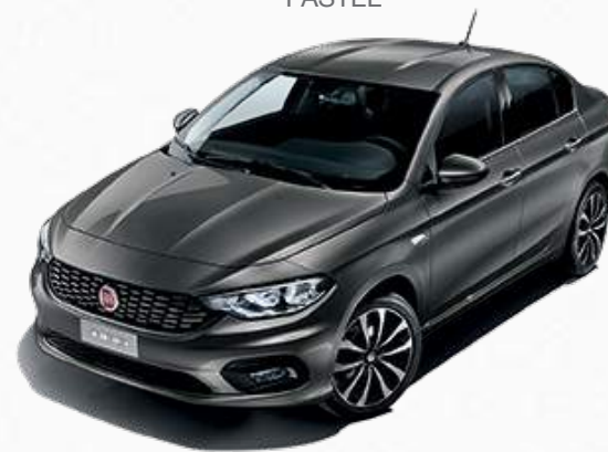
695 COLOSSEO GREY METALLIC