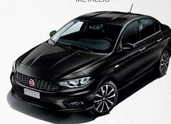
718 CINEMA BLACK METALLIC