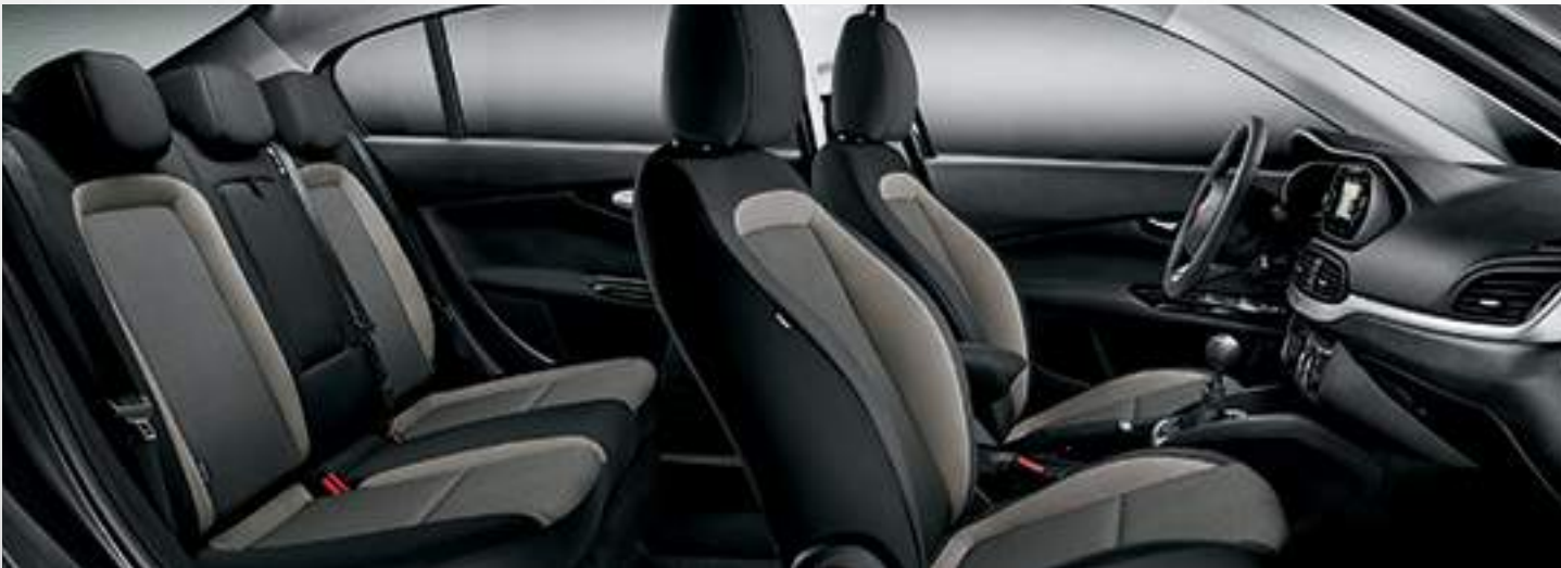
POP / EASY - INTERIOR WITH TEXTURED, TWO-TONE, GREY FABRIC UPHOLSTERY.