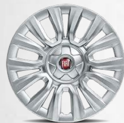
15" wheel caps