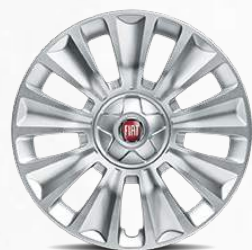
16" wheel caps