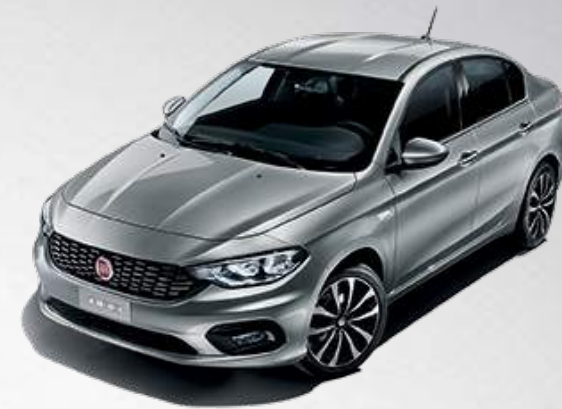
612 MAESTRO GREY METALLIC