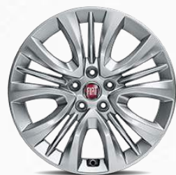
Alloy wheels 16"