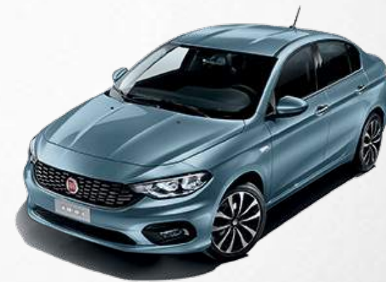
448 CANALGRANDE BLUE METALLIC