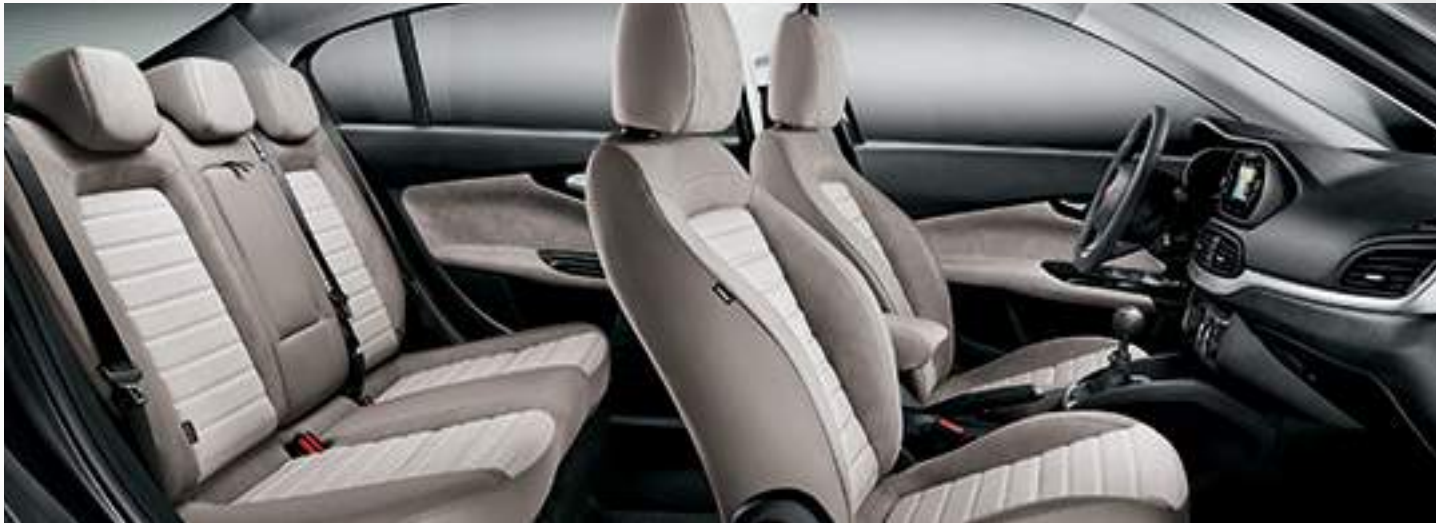
LOUNGE - INTERIOR WITH ELECTRO-WELDED, GREY-MIX FABRIC UPHOLSTERY.