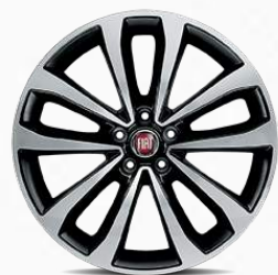
Alloy wheels 17" diamond-cut