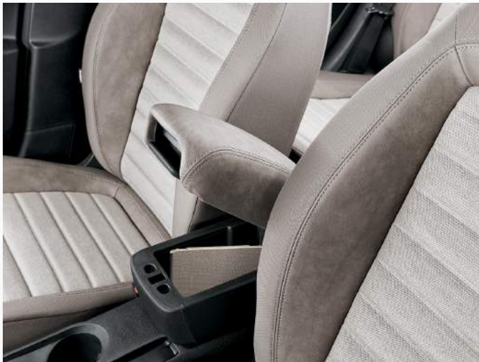
Front armrest with storage compartment.