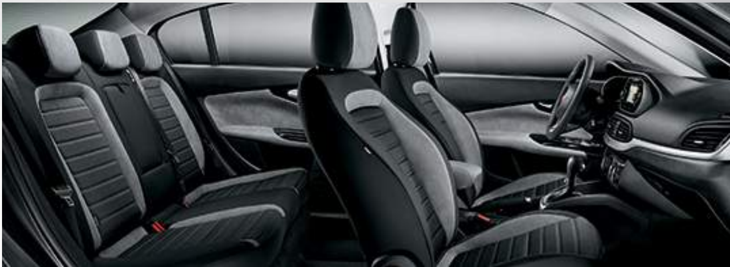
LOUNGE - INTERIOR WITH ELECTRO-WELDED, GREY-MIX FABRIC UPHOLSTERY.