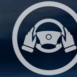
STEERING-WHEEL- MOUNTED CONTROLS