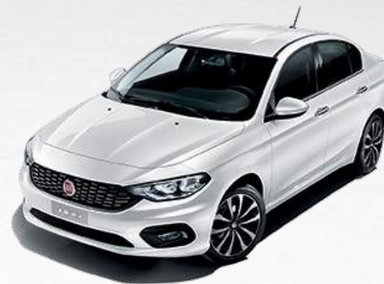
249 GELATO WHITE PASTEL