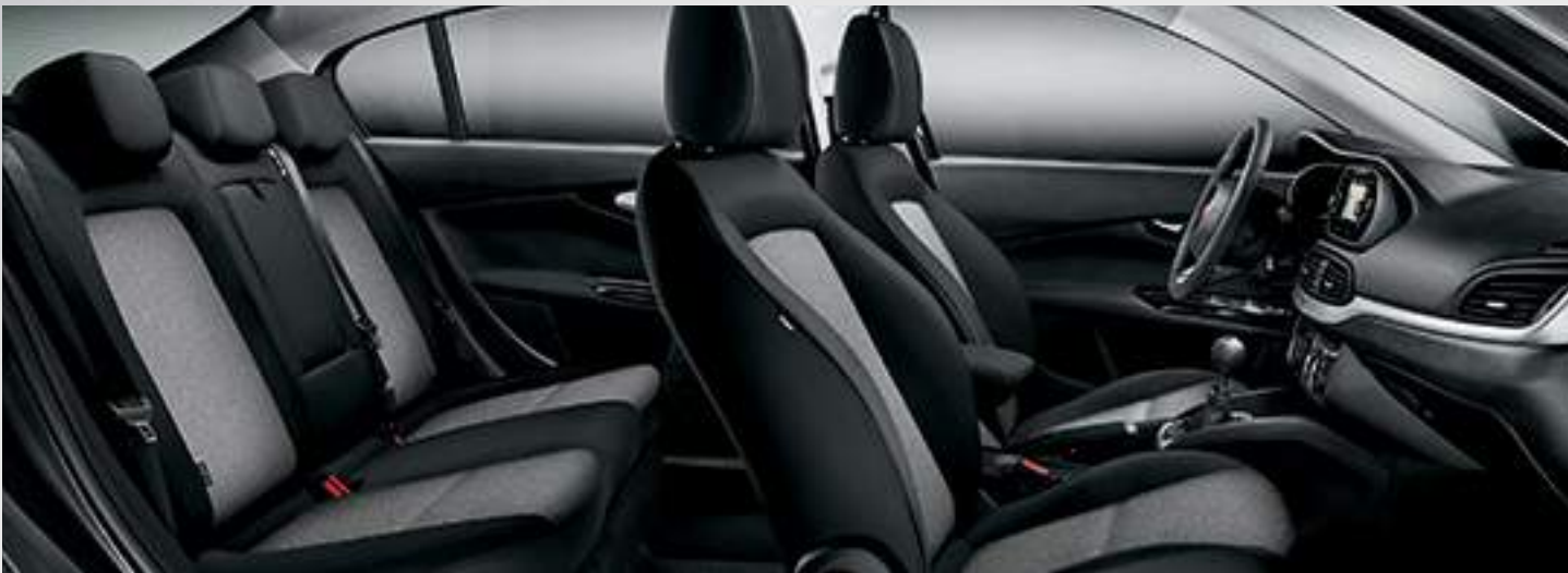
TIPO - INTERIOR WITH BLACK AND GREY INTEGRATED FABRIC UPHOLSTERY.