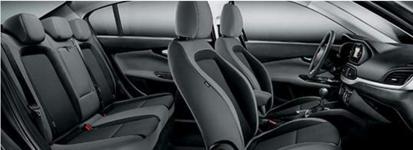
POP / EASY - INTERIOR WITH TEXTURED, TWO-TONE, DARK GREY FABRIC UPHOLSTERY.