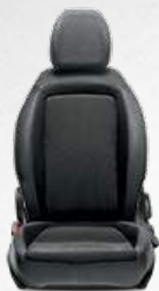
POP / EASY DARK GREY